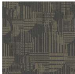
MODERN BOUTIQUE - 674