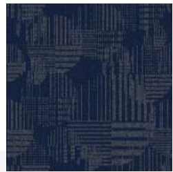
MODERN BOUTIQUE - 658