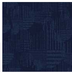
MODERN BOUTIQUE - 657