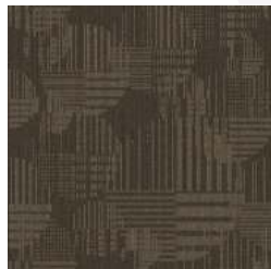
MODERN BOUTIQUE - 647