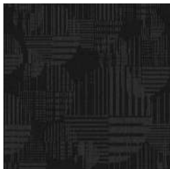
MODERN BOUTIQUE - 678