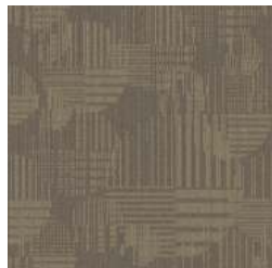
MODERN BOUTIQUE - 646