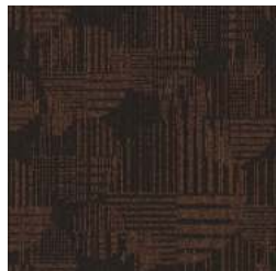
MODERN BOUTIQUE - 627