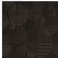
MODERN BOUTIQUE - 648