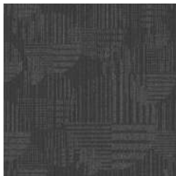
MODERN BOUTIQUE - 675